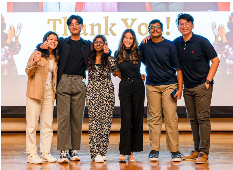
PFP Ambassadors Executive Committee (AY2022/2023)

The PFP Ambassadors are current students who have been specially nominated to be leaders, outreach representatives and mentors to future PFP students. Opportunities are plentiful for those keen in leadership development and to be more involved in student-centred activities.